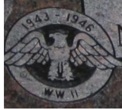
Military branch of Service