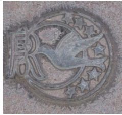
Daughters of Rebekah (Women's Auxiliary to I.O.O.F.)