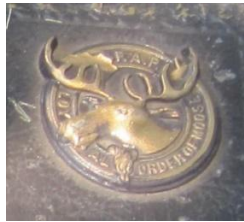
Order of the Moose