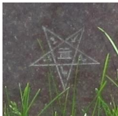
Order of the Eastern Star (Women's Auxiliary to the Masons)