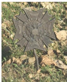
Veterans of Foreign Wars VFW marker