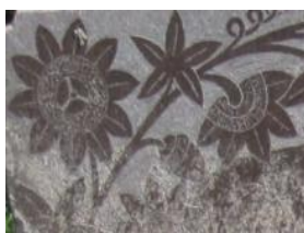
Passionflower Sacrifice & Redemption Devotion to faith