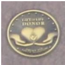
Organ donor emblem