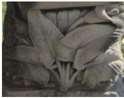
Calla Lily (with Anthurium)

Spiritual growth; prosperity, fruitfulness,