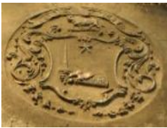
Family Crests (Buell Family)