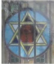
Star of David