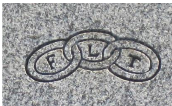
International Order of the Odd fellows I.O.O.F