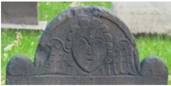
Head with Angel Wings