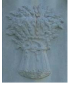
Bushel of Wheat

Long and fruitful life, typically more than 70 yrs; immortality, resurrection