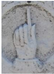
Finger pointing to Heaven

Soul rising to Heaven, two fingers pointing up; hand of God