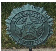
American Legion marker