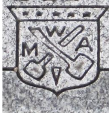
Modern Woodmen of America