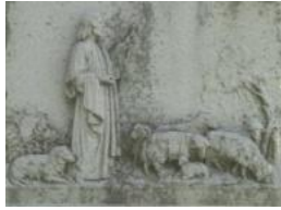
Jesus and his flock