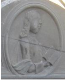
Reverend holding Bible (minister's grave)