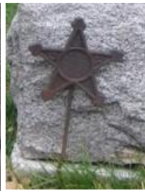
Grand Army of the Republic (Civil War Union Veteran Organization)