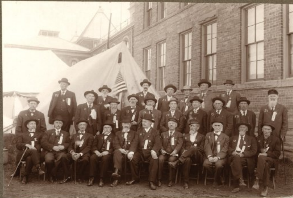
MEMBERS Association 7th Illinois Infantry Volunteers in Attendance at Reunion.

HELD AT SPRINGFIELD, ILL., OCTOBER 3-4, 1911